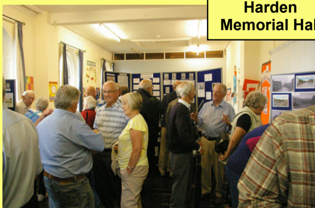
Harden Memorial Hall

Over 200 people came to see the First World War exhibition in Harden Memorial Hall on August 2nd.