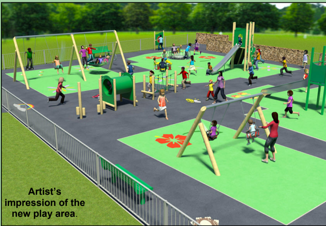
Artist's impression of the new play area.

T he Parish Council has been successful in a bid for £50,000 to renew the play area in Harden Park.