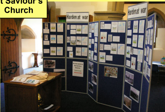
St Saviour's Church

A Memorial Booklet was produced and distributed to every house in the village.